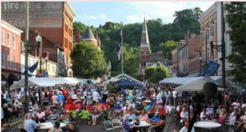
Maysville uncorked, complete with Fire!