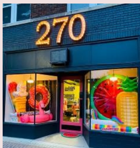
270 in downtown Scottsville is ready for summer, are you?

Check out all the businesses in KY Main Street communities for fun and exciting items to make your summer awesome!