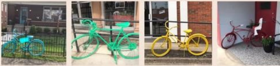
A few photos from recent Main Street events!