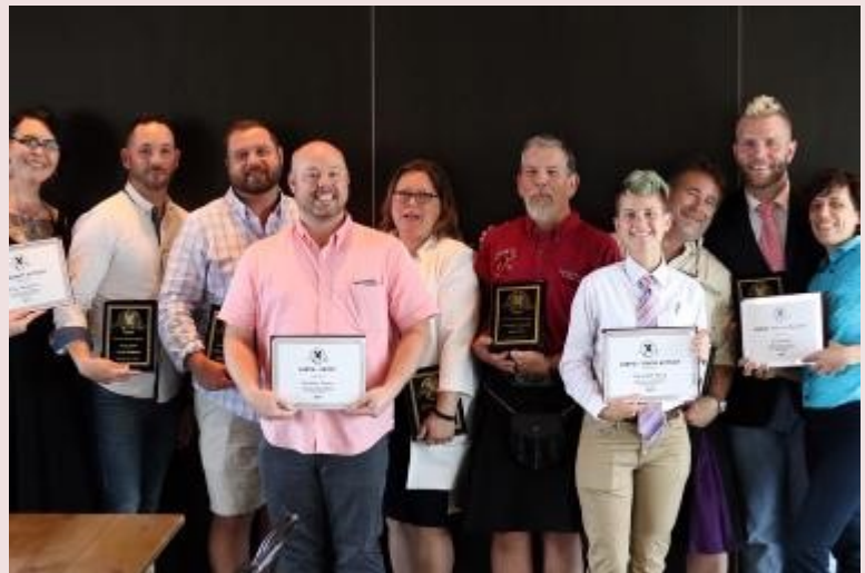
1st Annual NKY Pride Community Award Winners and Honorable Mentions.

Main Street strives to be inclusive and diverse and represent all members of a community.